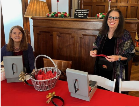
Buying the Raffle Tickets