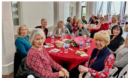
Morning Glories Having Fun