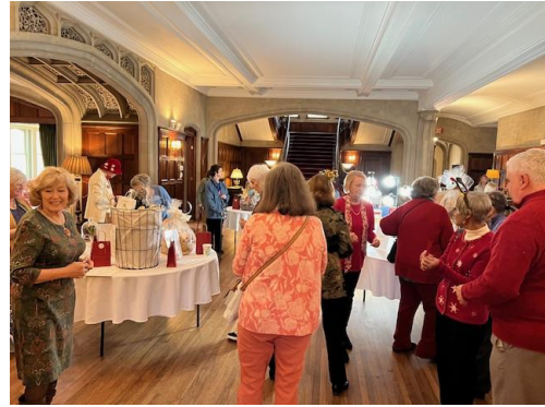
On To The Baskets