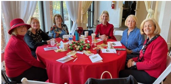
Dunwoody Just Chillin'