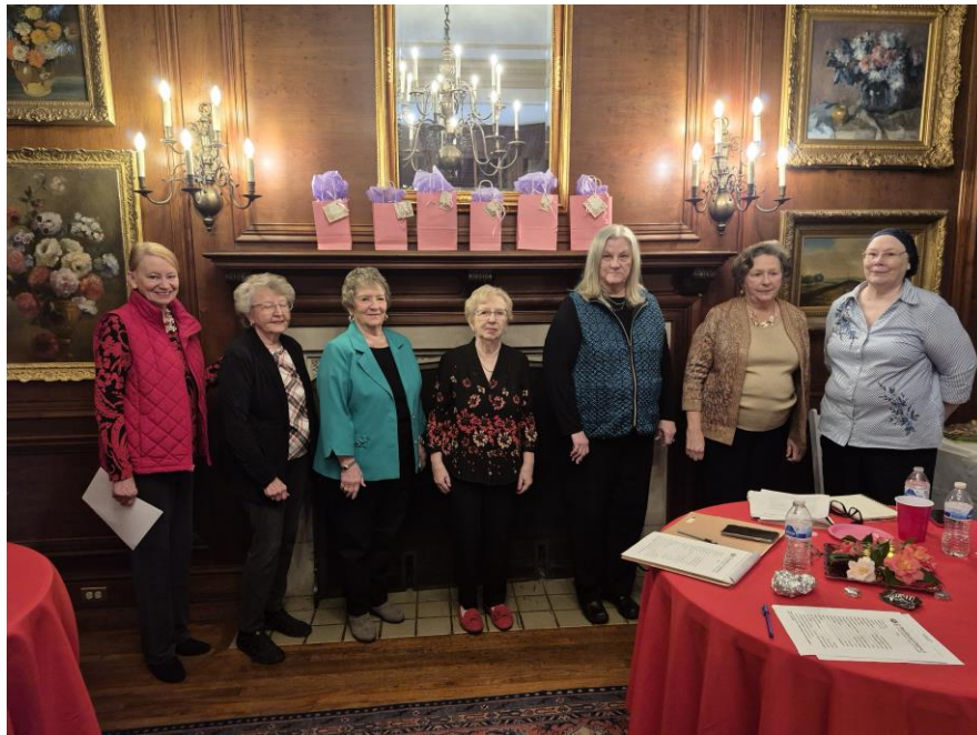
Redbud Officers (Left to Right)