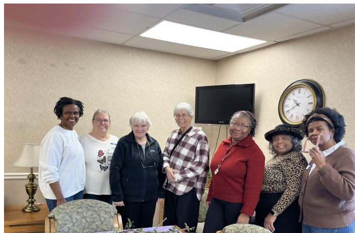
CGC Members Assisting With the Workshop