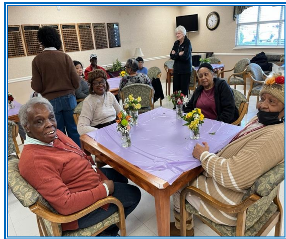
Seniors Display Their Handiwork!